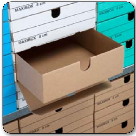
D80-Drawer (for D-Box 80)

Increases the versatility and rigidity of the D-Box system allowing the easy archiving of unclipped or loose items. 2 Piles of A5 documents or used till rolls can be filed in one box (Pk 25)