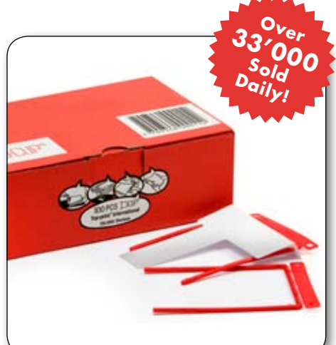
D-Clip The core component of the entire 'D' system. Enables easy transfer from lever arch files onto the D-Clip. Binds contents securely and in order for future referral (Pk 10/100 pcs)