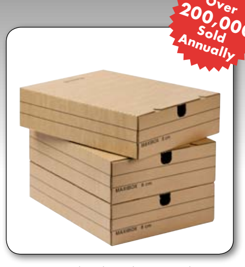
D-Box 80 High quality archive storage box allowing up to 8cm of document storage height. Available in: Yellow, Red, Blue, White & Green (Drawer available separately) (Pk 25)