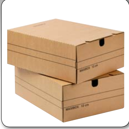
D-Box 120 High quality archive storage box allowing up to 12cm of document storage height.