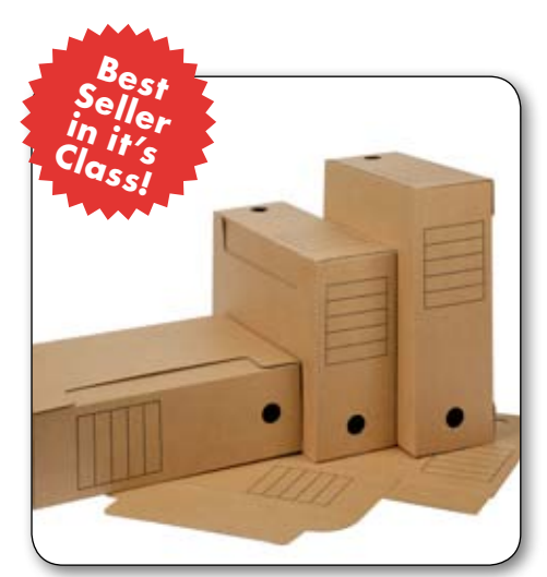
S-Box Unique high quality storage box, does not need folding; self assembling. Can be filed on base or side. Made of strong fluted.board. thumb hole for easy removal from shelf. (D 250mm x W 110mm H 330mm)

Magi-Clip Used for the storage of magazines