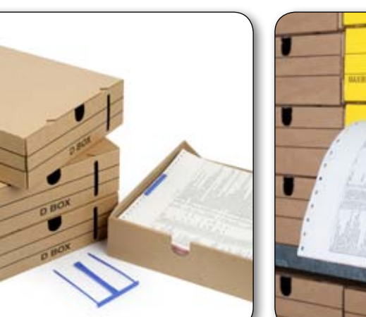
Comprises of a high quality storage box and drawer. Specifically sized for burst & unburst computer listing paper up to 12 inchs x 235mmm (Data Clip sold separately) (Pk 25)