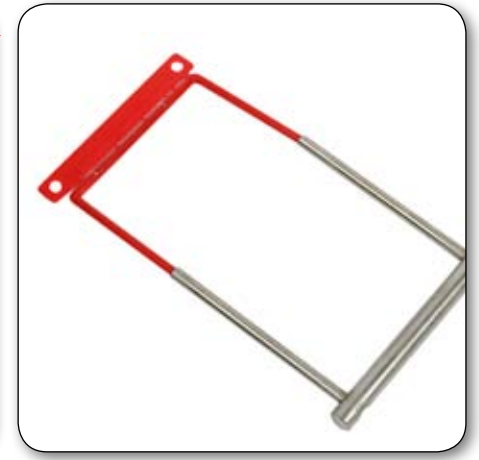
D-Tool For improving the access and removal of documents stored on a D-Clip. Also enables photocopying of D-clip bound documents without the need to remove them