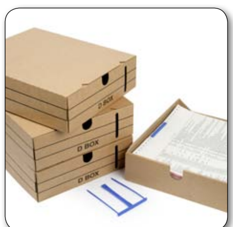
D-Box 1124 Combination Set