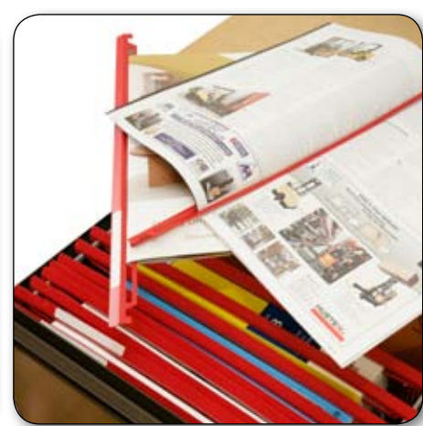
Index-Clip Suspension filing without the files! Simply slot the Index-Clip(s) between the pages of your pamphlets, magazines, or books - and file. Will easily support items as large as telephone directories. (Pk 100) Foolscap and A4 Sizes.