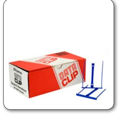
Data Clip Specifically designed to compliment the D-Box 1124 system for the storage of computer printouts. (Box of 100 pcs)