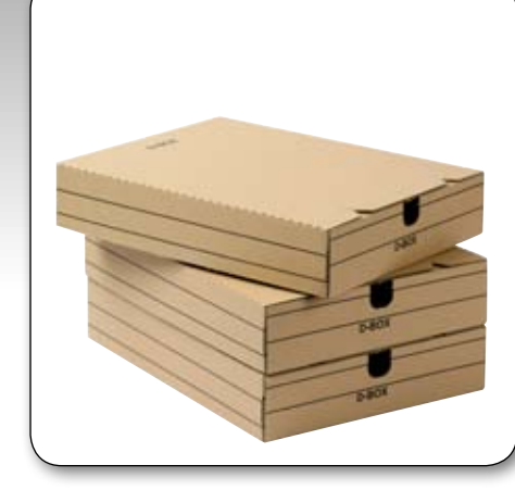
D-Box 60 High quality archive storage box allowing up to 6cm of document storage height.