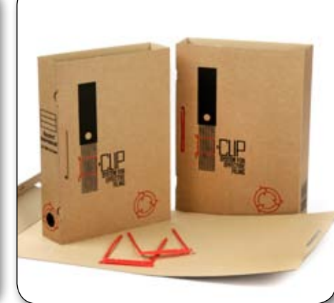
D-Case Used in conjunction with the D-Clip, simply fold the pre-creased board around the contents to obtain a free standing, space saving archive solution. Pre printed on outer packaging to label the contents. 14 D-Cases can be stored on a single shelf of the D-Rack system (Pk 25)

Increases the versatility and rigidity of the D-Box system allowing the easy archiving of unclipped or loose items. 2 Piles of A5 documents or used till rolls can be filed in one box (Pk 25)