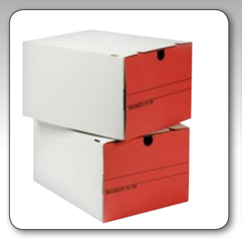
D-Box 180 High quality archive storage box allowing up to 18cm of document storage height